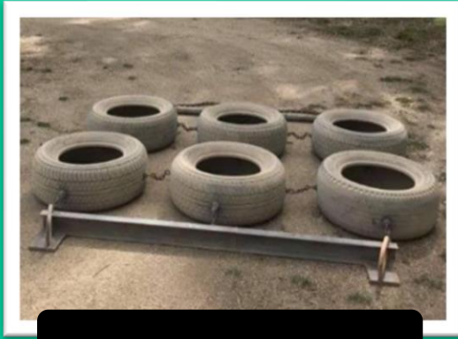
Bottom Arena Harrows