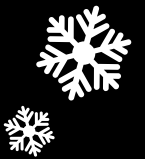
Leanne Le Claire & Bewitched Level 1 Winner TTT