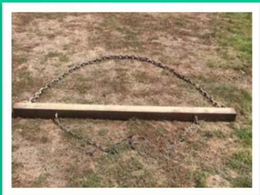
Top Arena Harrow