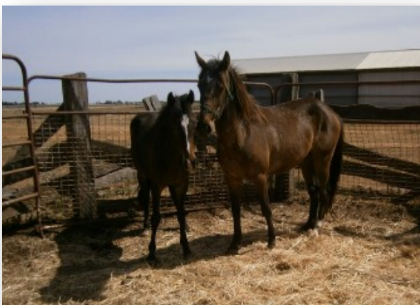
Rainman Seen here at the dealers/doggers just before he was on his one way trip. He was the last horse of this batch on the urgent list to sell. Photo taken somewhere in 2014.

Today I'd like to talk about Rainman. I saw a picture of him over 2 years ago, so young and innocent. Said to be a QH x Appy 4 to 5 years old (now 15hh), I couldn't let him go on the truck though waited and waited for someone else to step in. And so he is named after the rain which stopped the heavy truck from being able to enter the dealer/knackery yard to take him on his one way trip.