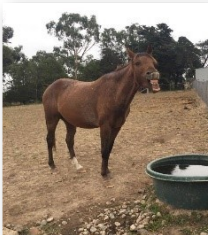
Rainman today, having a laugh!