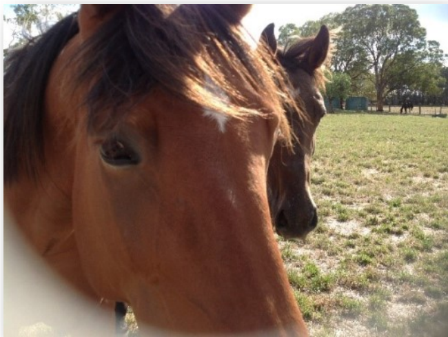
Seen here with STB Chuca, approx. 2 years ago, peeping around the corner!

Some months after arrival a local trainer helped me get a new head collar on but stayed outside my cattle yard, as he said Rainman was much too defensive and he the trainer would get hurt. I had been able to touch him before this but he remained very tentative about touch.